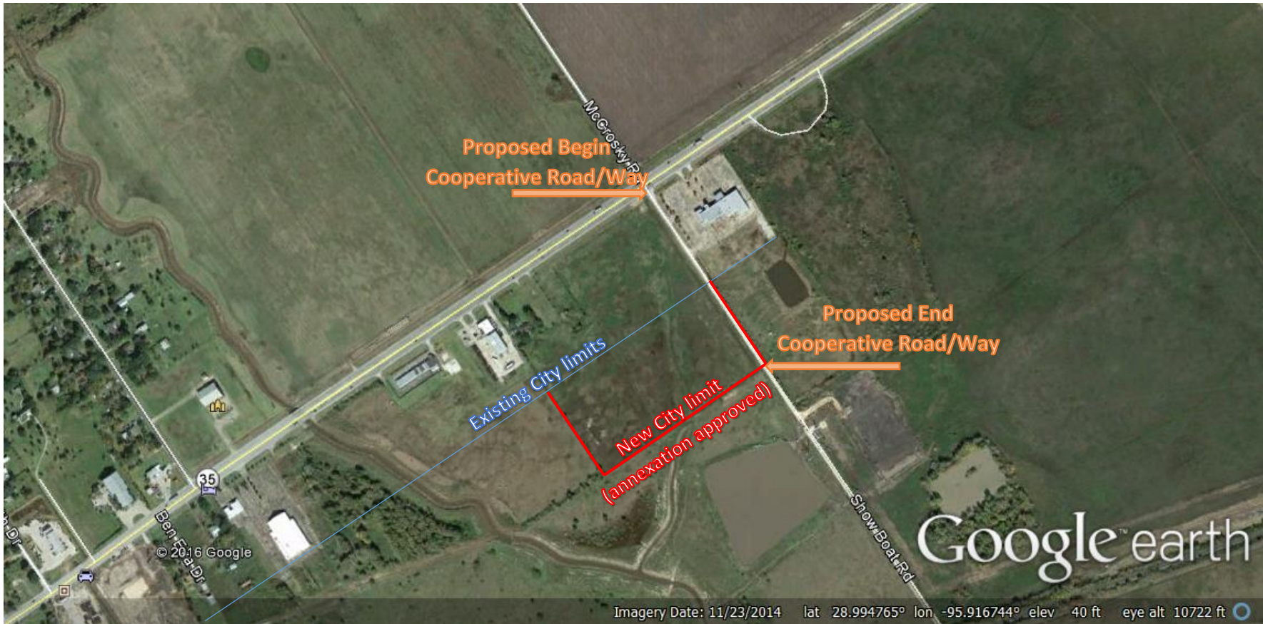
Street Name Request to rename "Showboat Road" within the Bay City city limits to "Cooperative Road" or "Cooperative Way"

Attachment: 20170421 - Cooperative Road limits (2606 : Renaming of Showboat Road)